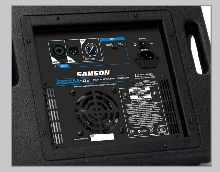
RSXM10A back panel